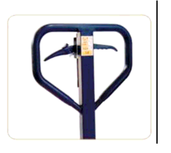
BRAKE PALLET TRUCK