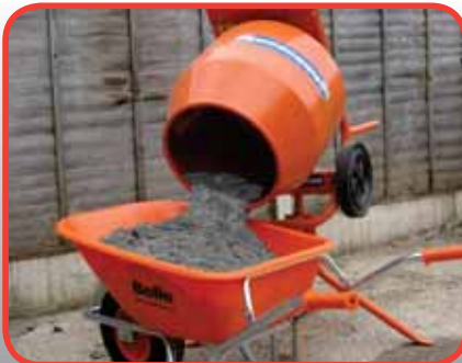
Ideal for use with Minimix 150