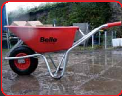
Ergonomically designed to maximise usability