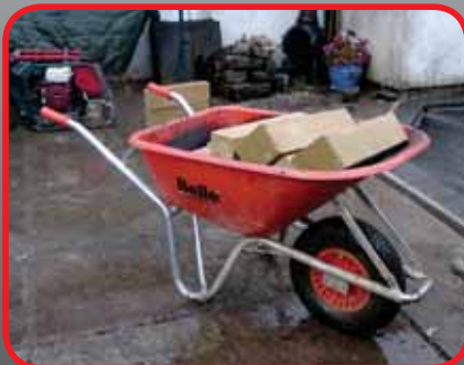
Ideal for use in the harshest of conditions