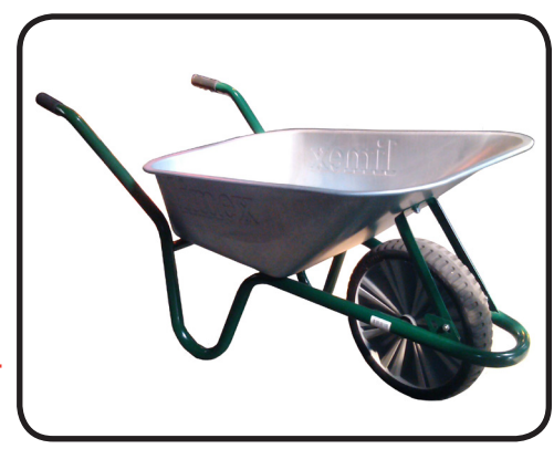
Standard 85 c/w Flex Lite Wheel