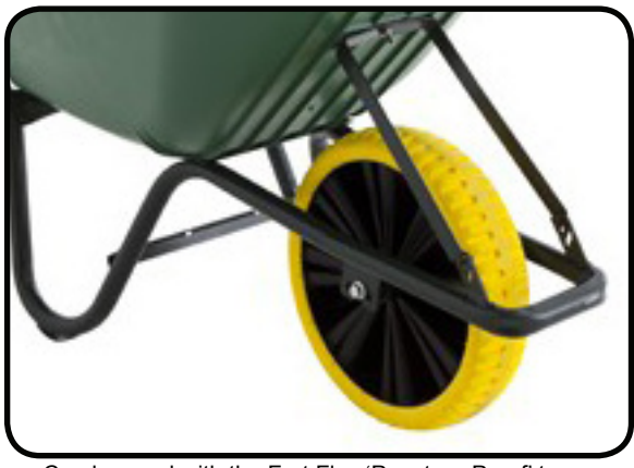
Can be used with the Fort Flex 'Puncture-Proof' tyres.