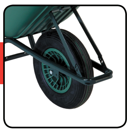
2 wheels locations for better balance.