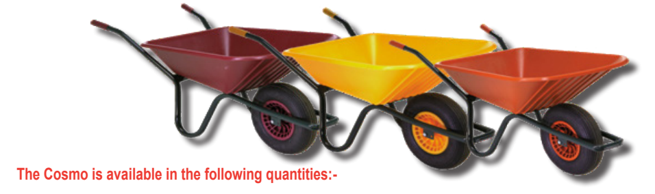
Ideal for equestrian usage.