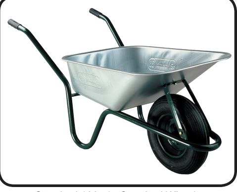
Standard 100 c/w Standard Wheel