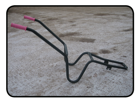
One-piece steel tubular frame