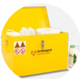
TransBank Chem TRB4C