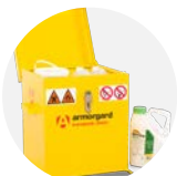
TransBank Chem TRB2C