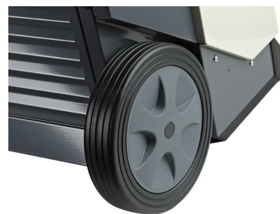
Big rubber wheels ensure safe and easy manoeuvring.