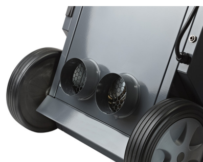
CDT 30S MK III and CDT 40S MK III are fitted with a 1 kW heating element, a high pressure fan and two duct spigots, allowing connection of two flexible air ducts Ø100, each up to 5 m long.