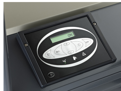
Digital display with integrated humidity control, energy counter, service status and easy fault finding allows optimal dehumidification.

The CDT range offers capacities from 29 to 86 l/24 h and a maximum working temperature of 35° C, as well as superior control of settings and operations. The digital finger touch display puts you in quick and easy control of humidity and service status. Furthermore, hours and energy consumption can be read off the display.