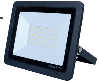
Image shown FLAC100BPC