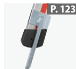
Set of swivelling foot pikes