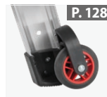
Fixed castor set