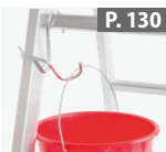
Bucket hook for rung ladders