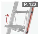
Folding universal ladder step