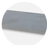
OxBox Shelf OX-S