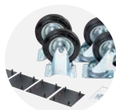
Castor Kit CASS1