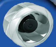
HIGH CAPACITY FAN

FLOOD & RESTORATION • BASEMENTS • CELLARS • OFFICES ROOF LEAKS • GARAGES • TRADESMEN • HIRE TRADE