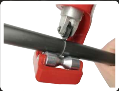
STEP 1: CIRCUMFERENTIAL CUT

Complete 5-step process of using the SACS® Tool. Cutting wheel depth will vary according to cable size, progressive advancement is best.