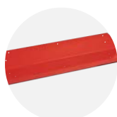
TuffBank Shelf SHE-4

Disclaimer: all dimensions and weights are approximate