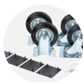
Castor Kit CASS1