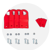
Crane lifting eyes CLEK