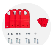
Crane lifting eyes CLEK