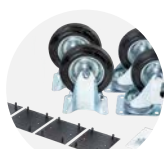
Castor Kit CASS1