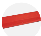
TuffBank Shelf SHE-4