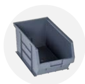
Fittings bins FCB