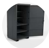
TuffStor Cabinet TSC6