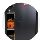
TuffStor Cabinet TSC2