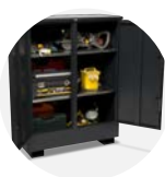
TuffStor Cabinet TSC3