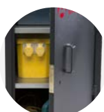
TuffStor Cabinet TSC1

Disclaimer: all dimensions and weights are approximate