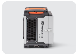
OUTLET BAR – A 25