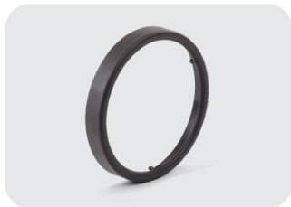
INLET ADAPTER RING