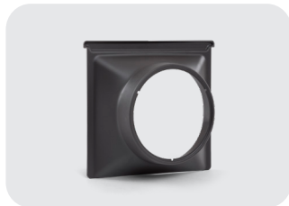
INLET ADAPTER – A 25