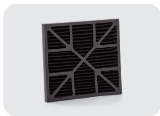
PRE FILTER 15-PACK