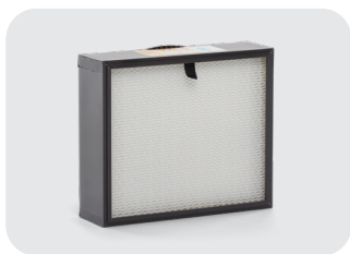
H13 ESSENTIAL FILTER