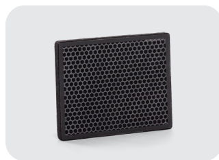
FILTER CARBON FILTER 5-PACK