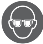
Wear eye protection