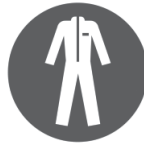
Wear protective clothing