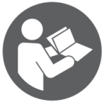
Refer to instructions

IMPORTANT: PLEASE READ THESE INSTRUCTIONS CAREFULLY. NOTE THE SAFE OPERATIONAL REQUIREMENTS, WARNINGS & CAUTIONS. USE THE PRODUCT CORRECTLY AND WITH CARE FOR THE PURPOSE FOR WHICH IT IS INTENDED. FAILURE TO DO SO MAY CAUSE DAMAGE AND/OR PERSONAL INJURY AND WILL INVALIDATE THE WARRANTY. KEEP THESE INSTRUCTIONS SAFE FOR FUTURE USE.