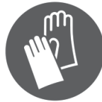
Wear protective gloves