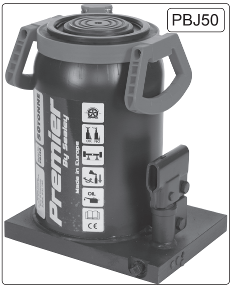
Original Language Version