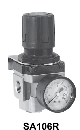
Refer to instruction manual