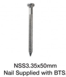
NSS3.35x50mm Nail Supplied with BTS.