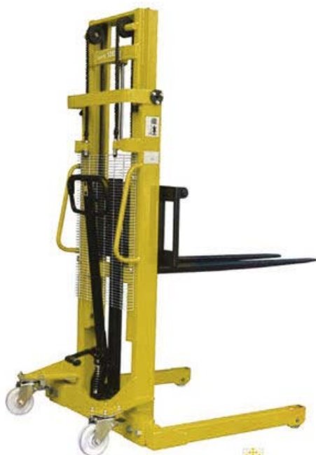
Straddle-leg Manual Stacker