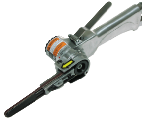
Order Code: SP-938