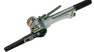
Order Code: SP-941