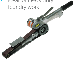
Order Code: SP-942