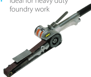
Order Code: SP-944