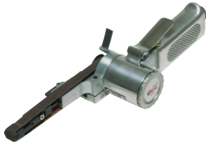
Order Code: SP-936