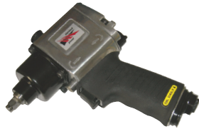
Order Code: TH-W11