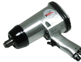
Order Code: SP-W25