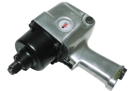
Order Code: TH-W16