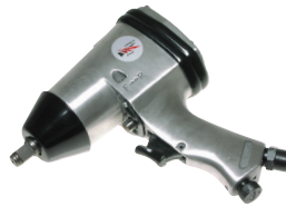
Order Code: SP-W15