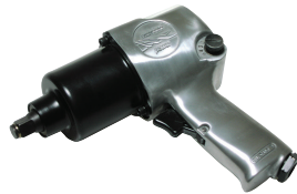
Order Code: TH-W12