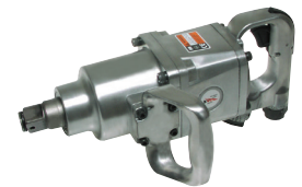
Order Code: TH-W18S