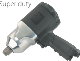
Order Code: AR-2025PT