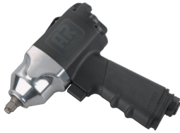
Order Code: AR2005PT