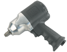
Order Code: CA-2015PT