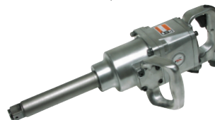
Order Code: TH-W18